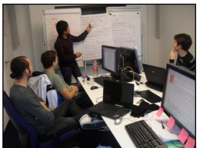
Advanced Study Group (Winter Team 2011)

The focus of Systems Engineering is to scope the overall concept and to structure this system in manageable subsystems. By focussing on the system requirements as a whole (Operation, Cost, Timeline, Performance, Support, Testing), Systems Engineering combines the different engineering disciplines into one structured process based on team-work.